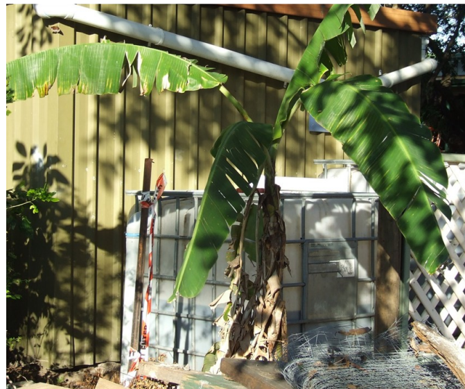
Above: Water is harvested from this new shed into donated square tanks. It is gravity fed by hoses to the gardens so doesn't need a pump.

We noticed a distinct lack of grasshoppers ... because of all the birds around perhaps?