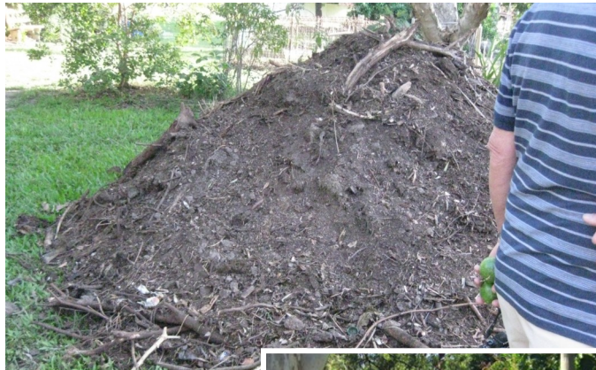
Above: a pile of rich compost before sifting

Right: Troy demonstrating the ingenious sifter for compost. It was made using two bicycle wheels connected with mesh. They revolve on two small wheels to rotate the barrel. Sifted compost lands in wheelbarrow below.