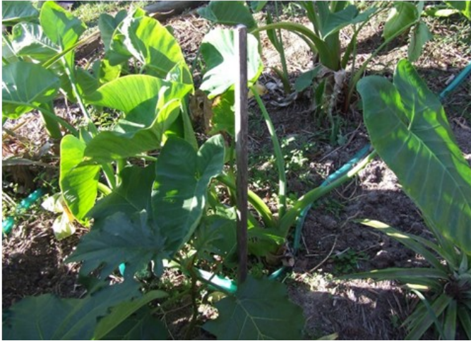
Above: Taro growing—this indicates the diversity of people who garden here and want different vegetables such as cassava and yacon.

An extensive orchard has a variety of exotic and native fruit trees, including three types of figs.