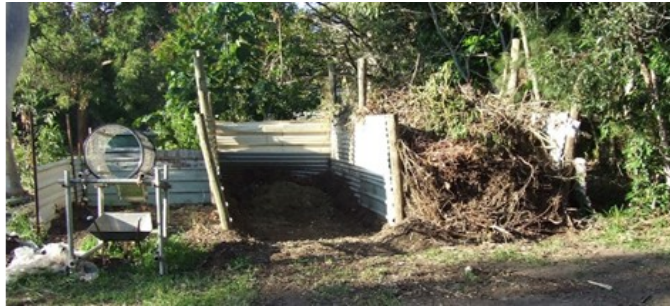
Above: the compost bays

The soil isn't good for growing food, so members make copious amounts of compost.