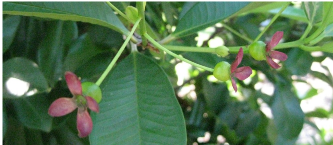
Above: Grumichama fruit forming.