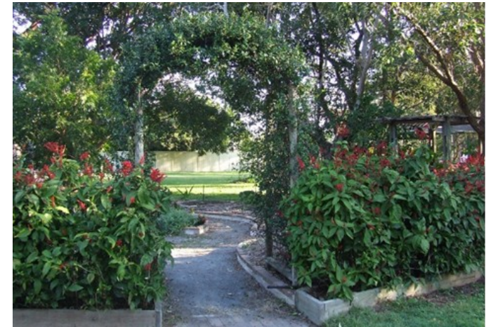
Above: One of the many beautiful archways. It is worth a visit so you can get some ideas for your own garden.

Right: Long garden beds are favoured so they can be cultivated using a rotary hoe.