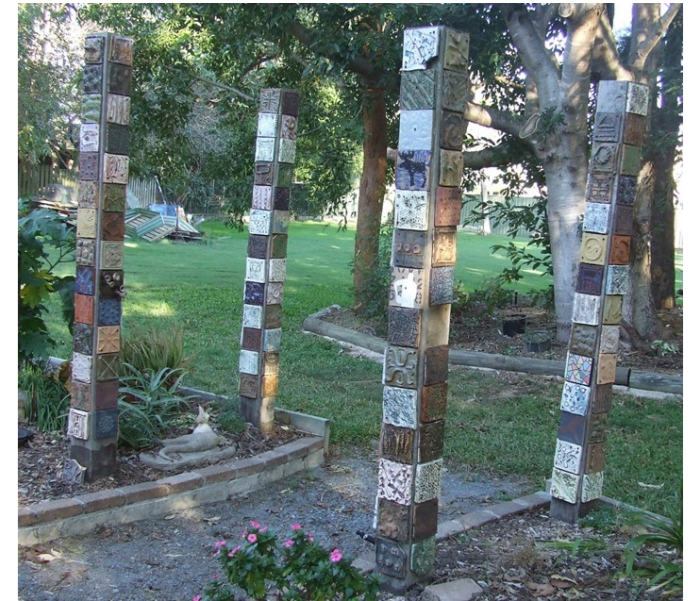
Above: The tiles on these poles were made by visiting children. The installation was constructed as a commemoration of Australian heritage.