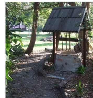
Left: a bit of whimsy — the wishing well. Re-used and recycled materials have been used extensively for garden structures