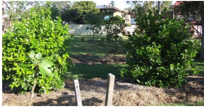
Above: A guava and a grumichama. Grumichama is a small dark fruit often considered to be the tropical version of a cherry. There are natives such as Davidson plum and lillypilly.