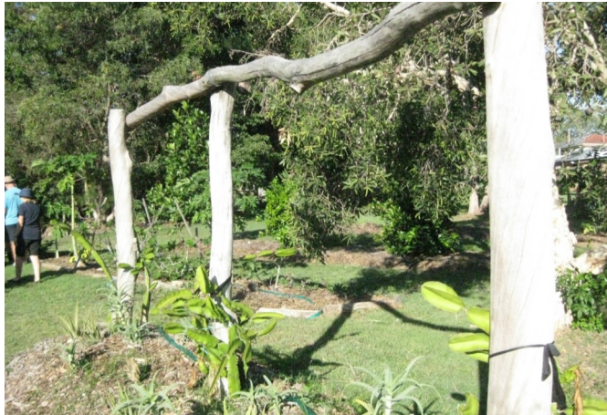
Above: Growing dragonfruit. It will climb up and then along the posts. Fruit will form on the 'arms' that will later hang down from the top rail.